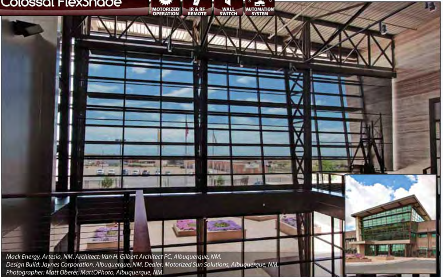
Mack Energy, Artesia, NM. Architect: Van H. Gilbert Architect PC, Albuquerque, NM. Design Build: Jaynes Corporation, Albuquerque, NM. Dealer: Motorized Sun Solutions, Albuquerque, NM.