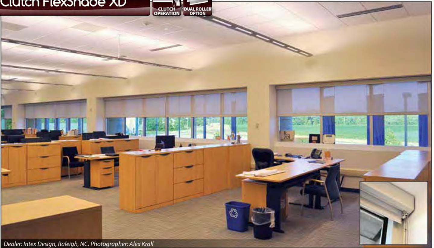
Dealer: Intex Design, Raleigh, NC.