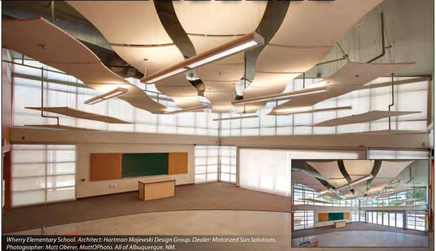
Wherry Elementary School. Architect: Hartman Majewski Design Group. Dealer: Motorized Sun Solutions. All of Albuquerque, NM.